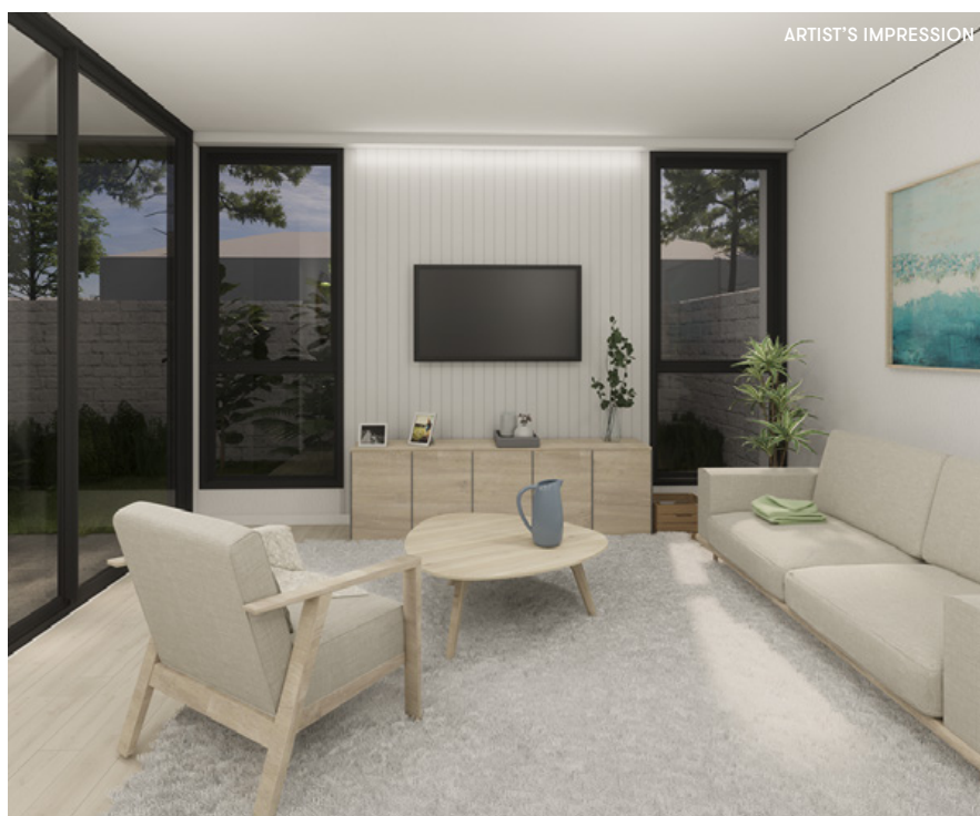
LARGE RELAXED LIVING AREAS