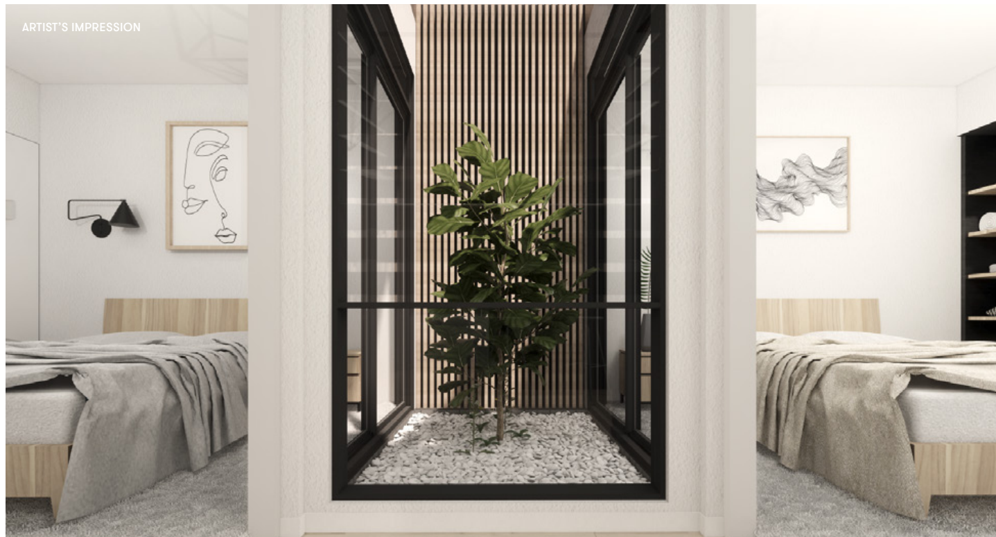
CAREFULLY DESIGNED INTERIOR SPACES WITH AN ABUNDANCE OF NATURAL LIGHT

Enjoy Architecturally designed 3 bedroom terraces in the heart of the Moreton Bay region. From $389,980, enjoy unrivalled views, amenities and lifestyle.