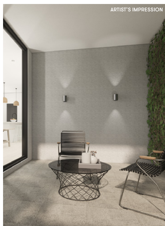
BEAUTIFULLY DESIGNED RELAXING OUTDOOR AREAS