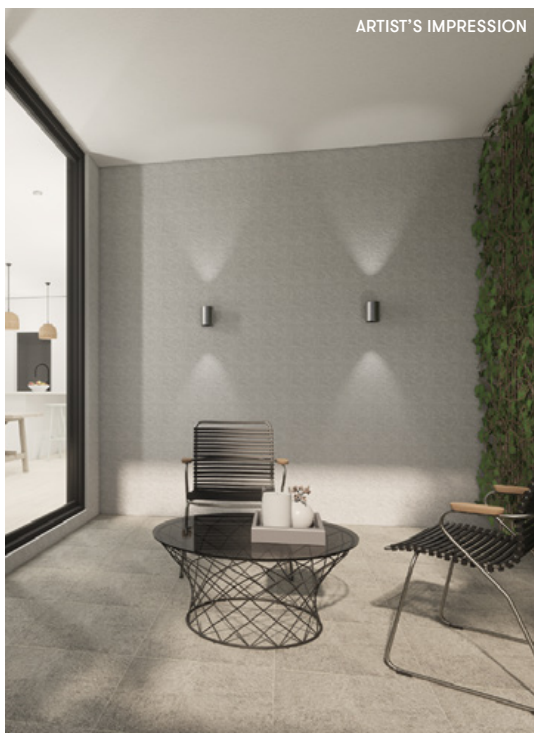
BEAUTIFULLY DESIGNED RELAXING OUTDOOR AREAS