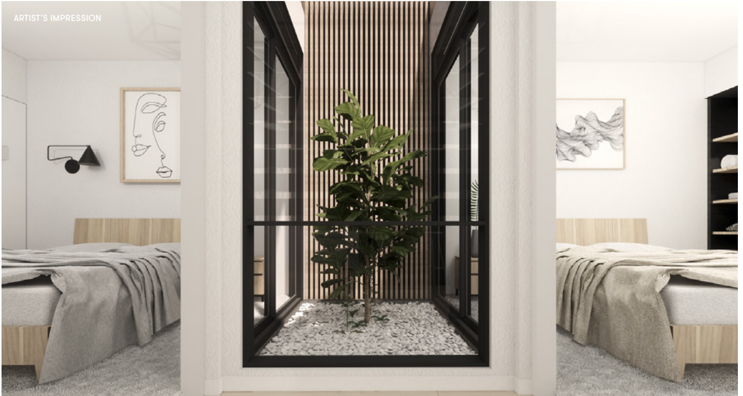
CAREFULLY DESIGNED INTERIOR SPACES WITH AN ABUNDANCE OF NATURAL LIGHT

Enjoy Architecturally designed 3 bedroom terraces in the heart of the Moreton Bay region. From $389,980, enjoy unrivalled views, amenities and lifestyle.